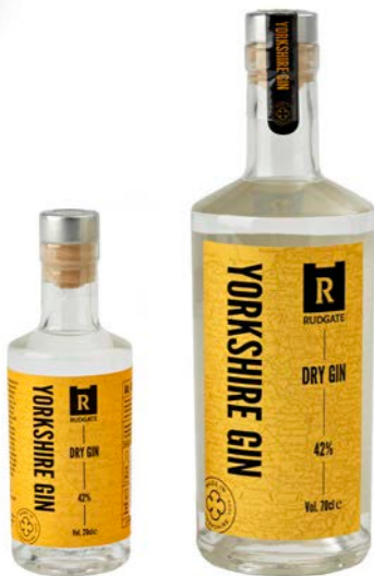
Available in 70 and 20cl bottles