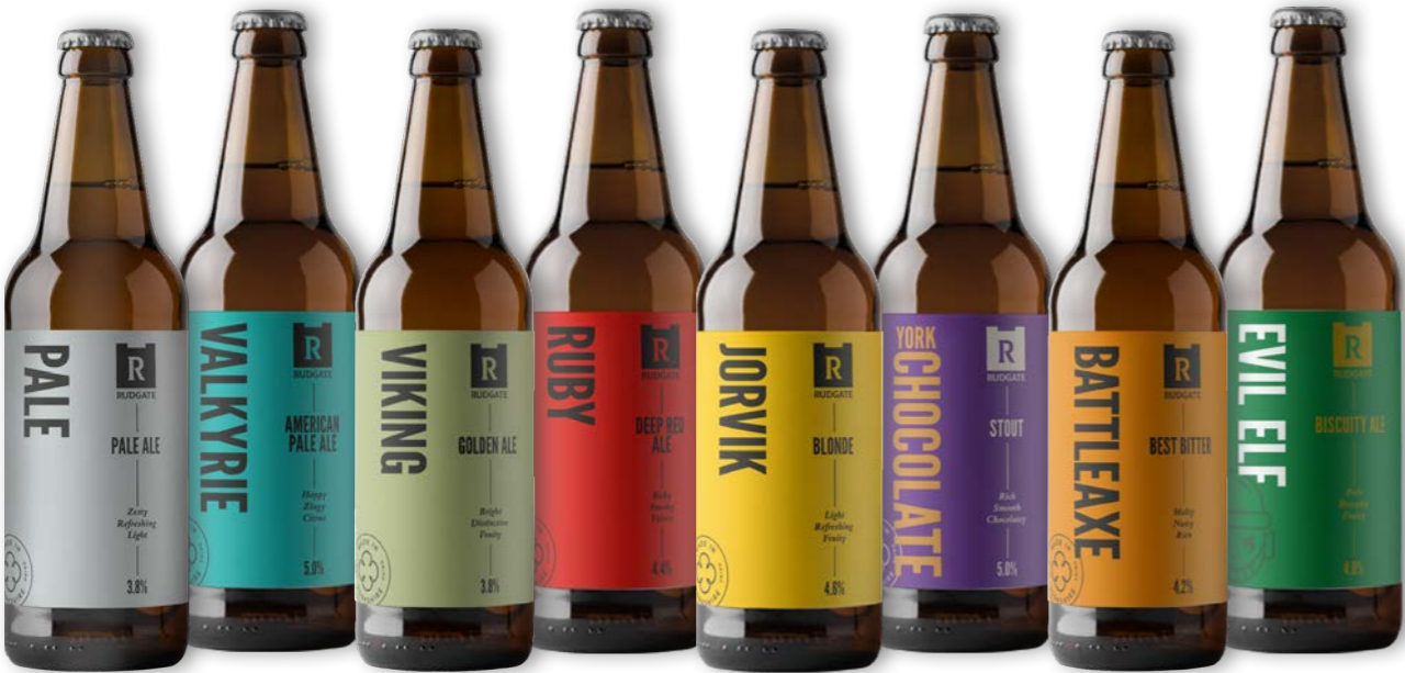
Available in packs of 8 x 500ml