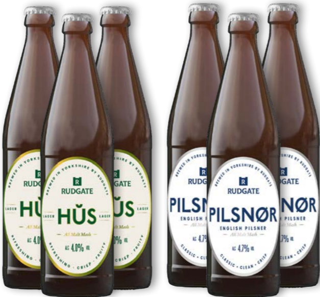
Available in 50cl bottles