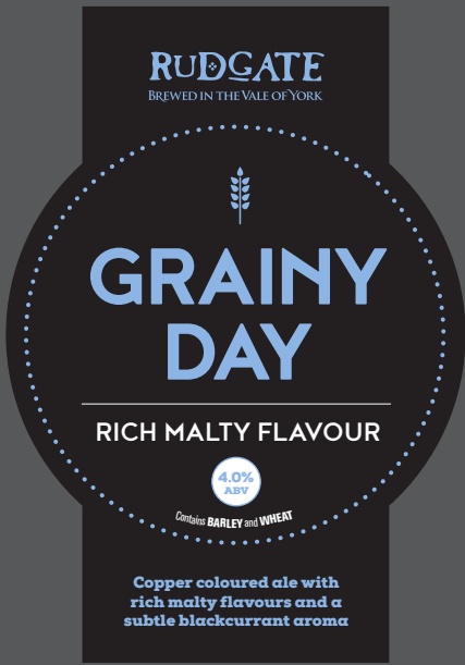
GRAINY DAY 4.0% Copper coloured ale with rich malty flavours and a subtle blackcurrant aroma.