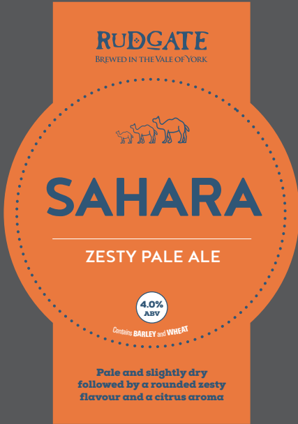
SAHARA 4.0% Pale and slightly dry followed by a rounded zesty flavour and a citrus aroma.