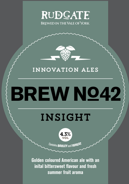
BREW 42 INSIGHT 4.3% Golden coloured American ale with an initial bittersweet flavour and fresh summer fruit aroma.