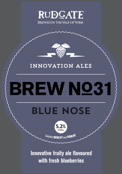
BREW 31 BLUE NOSE 5.2% Innovative fruity ale flavoured with fresh blueberries.