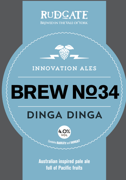
BREW 34 DINGA DINGA 4.0% Australian inspired pale ale full of Pacific fruits.