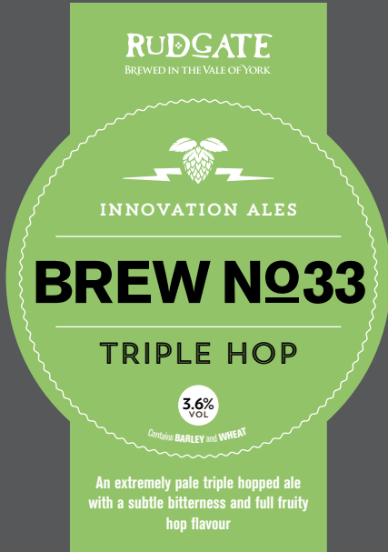
BREW 33 TRIPLE HOP 3.6% An extremely pale triple hopped ale with a subtle bitterness and full fruity hop flavour.