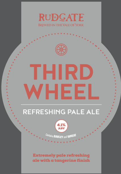
THIRD WHEEL 4.1% Extremely pale refreshing ale with a tangerine finish.