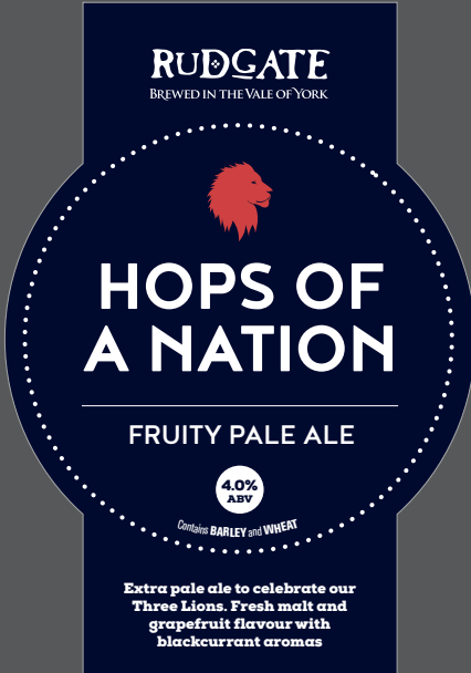
HOPS OF A NATION 4.0% Extra pale ale to celebrate our Three Lions. Fresh malt and grapefruit flavour with blackcurrant aromas.