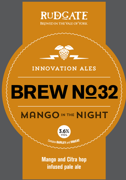
BREW 32 MANGO IN THE NIGHT 3.6% Mango and Citra hop infused pale ale.