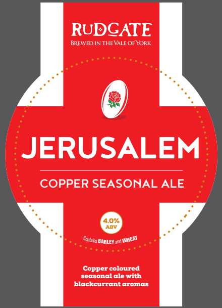
JERUSALEM 4.0% Copper coloured seasonal ale with blackcurrant aromas.