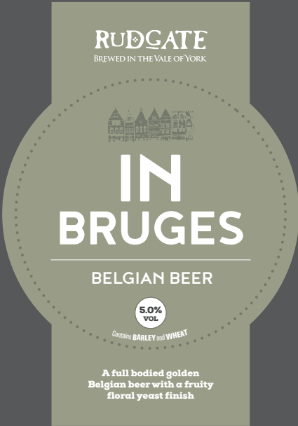
IN BRUGES 5.0% A full bodied golden Belgian beer with a fruity floral yeast finish.