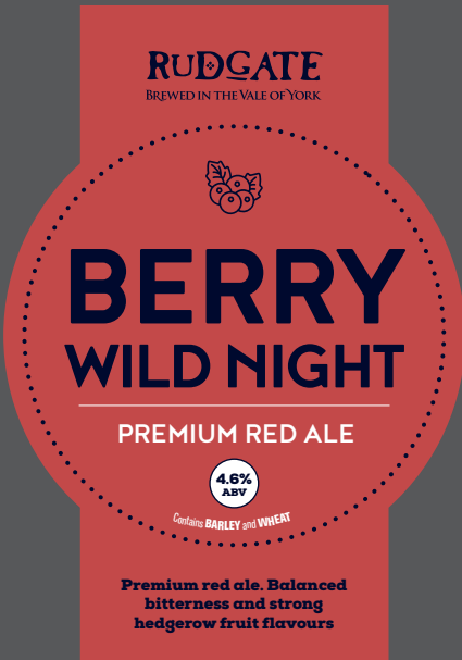
BERRY WILD NIGHT 4.6% Premium red ale. Balanced bitterness and strong hedgerow fruit flavours.