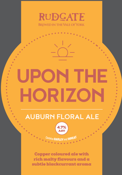
UPON THE HORIZON 4.7% An auburn coloured premium bitter with floral, spicy aromas.