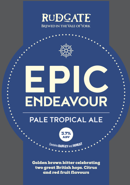
EPIC ENDEAVOUR 3.7% Golden brown bitter celebrating two great British hops. Citrus and red fruit flavours.