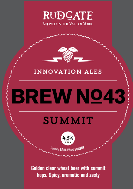
BREW 43 SUMMIT 4.3% Golden clear wheat beer with summit hops. Spicy, aromatic and zesty.