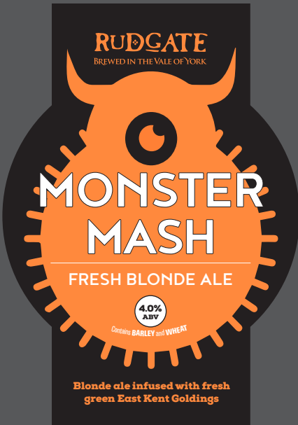
MONSTER MASH 4.0% Blonde ale infused with fresh green East Kent Goldings.