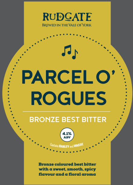
PARCEL O' ROGUES 4.1% Bronze coloured best bitter with a sweet, smooth, spicy flavour and a floral aroma.