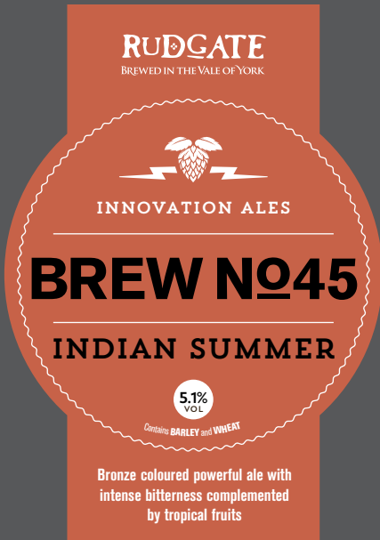
BREW 45 INDIAN SUMMER 5.1% Bronze coloured powerful ale with intense bitterness complemented by tropical fruits.