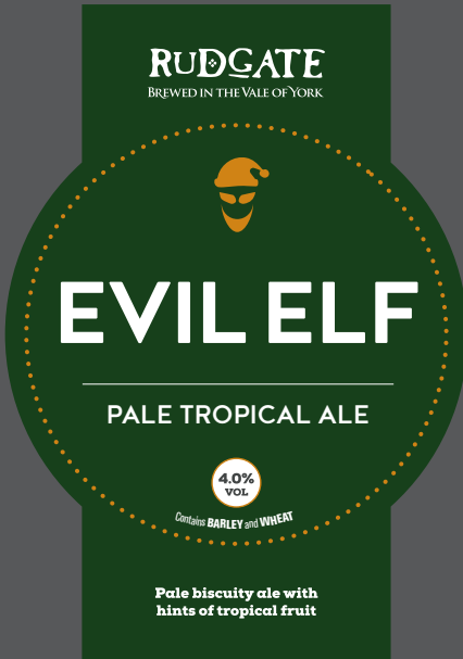
EVIL ELF 4.0% Pale biscuity ale with hints of tropical fruit.