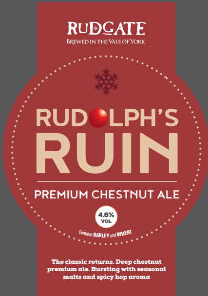
RUDOLPH'S RUIN 4.6% The classic returns. Deep chestnut premium ale, bursting with seasonal malts and spicy hop aroma.