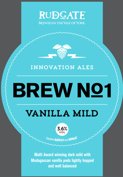
BREW 1 VANILLA MILD 3.6% Multi award winning dark mild with Madagascan vanilla pods lightly hopped and well balanced.