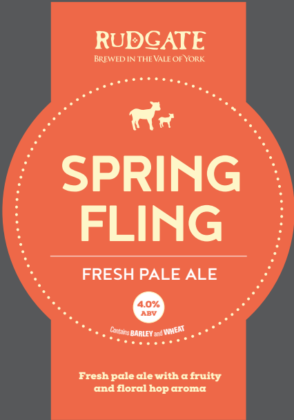
SPRING FLING 4.0% Fresh pale ale with a fruity and floral hop aroma.