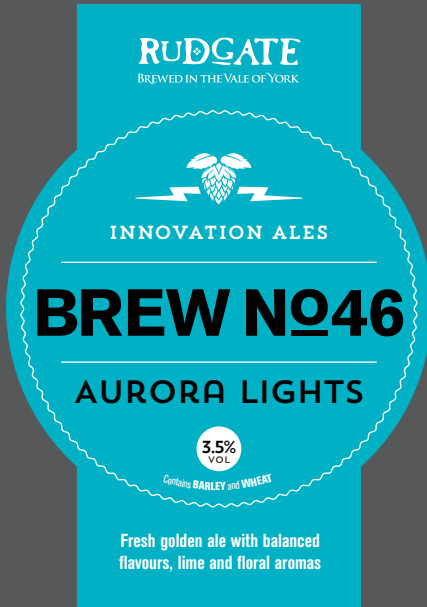
BREW 46 AURORA LIGHTS 3.5% Fresh golden ale with balanced flavours, lime and floral aromas.