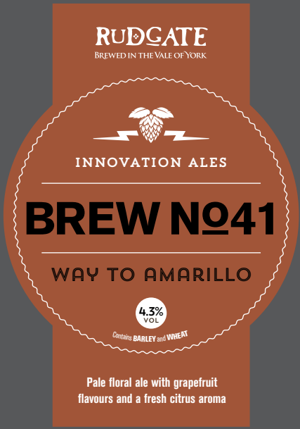
BREW 41 WAY TO AMARILLO 4.3% Pale floral ale with grapefruit flavours and a fresh citrus aroma.