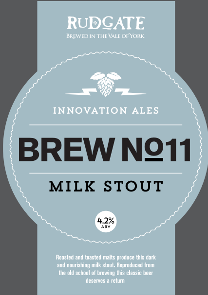
BREW 11 MILK STOUT 4.2% Milk stout roasted and toasted malts produce this dark and nourishing milk stout. Reproduced from the old school of brewing, this classic beer deserves a return.