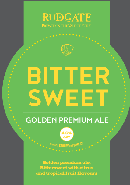
BITTER SWEET 4.6% Golden premium ale. Bittersweet with citrus and tropical fruit flavours.