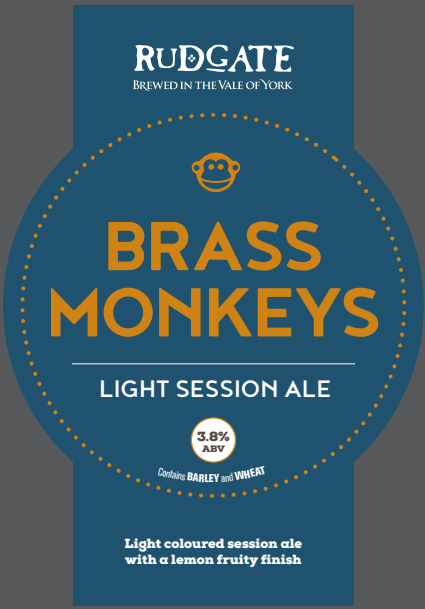
BRASS MONKEYS 3.8% Light coloured session ale with a lemon fruity finish.