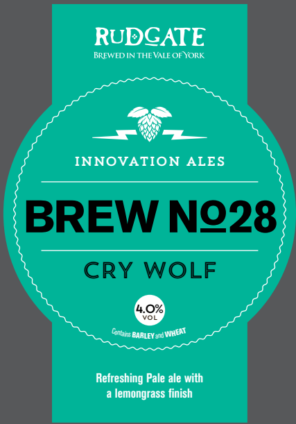
BREW 28 CRY WOLF 4.0% Refreshing pale ale with a lemongrass finish.