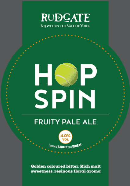
HOP SPIN 4.0% Golden coloured bitter. Rich malt sweetness, resinous floral aroma.