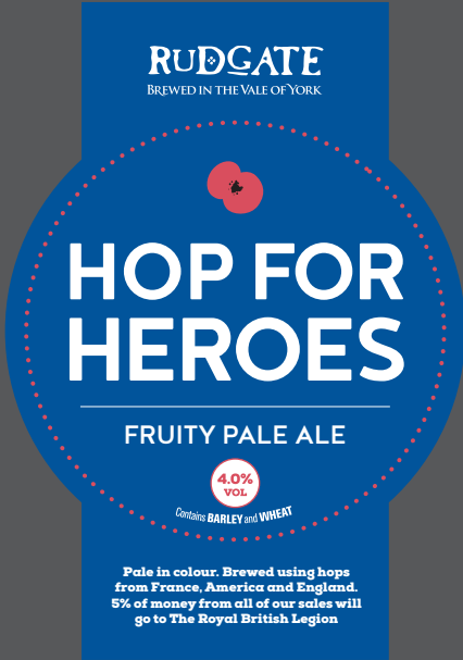
HOP FOR HEROES 4.0% Pale in colour. Brewed using hops from France, America and England. 5% of money from all of our sales will go to The Royal British Legion.