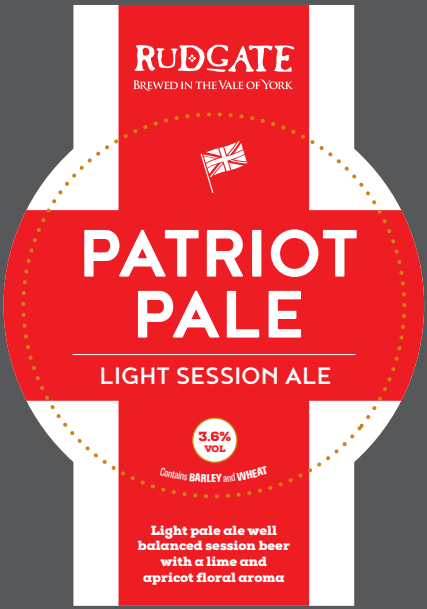
PATRIOT PALE 3.6% Light pale ale well balanced session beer with a lime and apricot floral aroma.