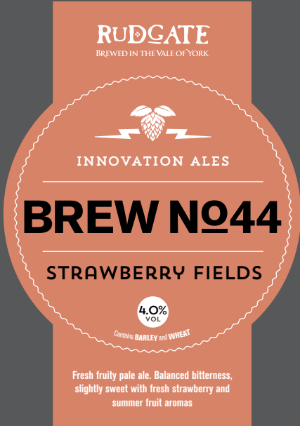
BREW 44 STRAWBERRY FIELDS 4.0% Fresh fruity pale ale. Balanced bitterness, slightly sweet with fresh strawberry and summer fruit aromas.