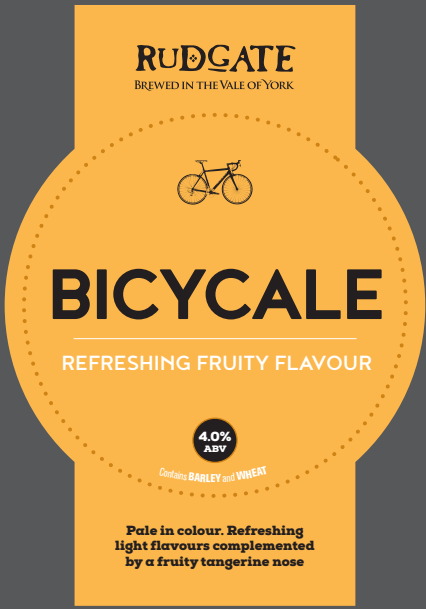
BICYCALE 4.0% Pale in colour. Refreshing light flavours complemented by a fruity tangerine nose.