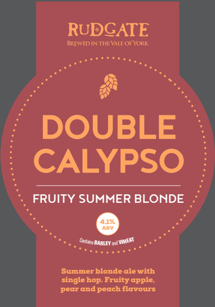
DOUBLE CALYPSO 4.1% Summer blonde ale with single hop. Fruity apple, pear and peach flavours.