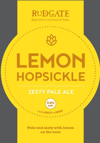
LEMON HOPSICKLE 3.6% Pale and zesty with lemon on the nose.